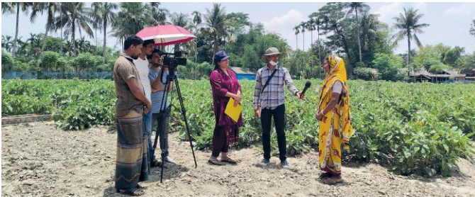
Place: Shyamnagar Upazila, Satkhira District (South Bangladesh)

In the final dissemination event, the final version of the documentary which is prepared by GRRIPP South Asia will be launched. Commissioning projects of India, Bangladesh and Nepal have also recorded their on ground activities which will be a part of the documentary. The flavor of South Asia as well as the unheard voices of many rural intersectional people will come forward through this initiative.